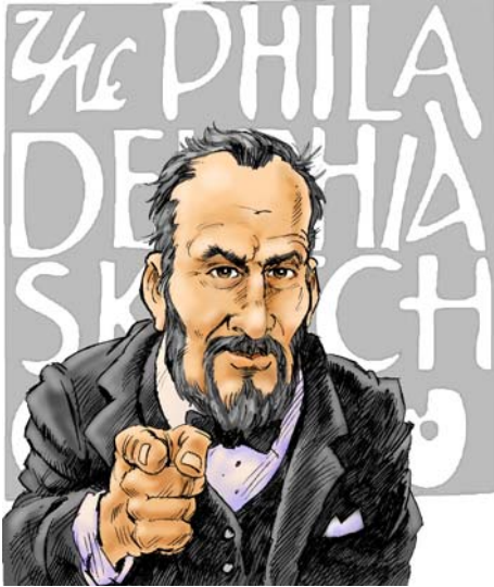
Illustration by Rich Harrington