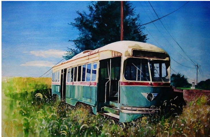
James Raymond, “Route 61”, Oil, 16x20 inches