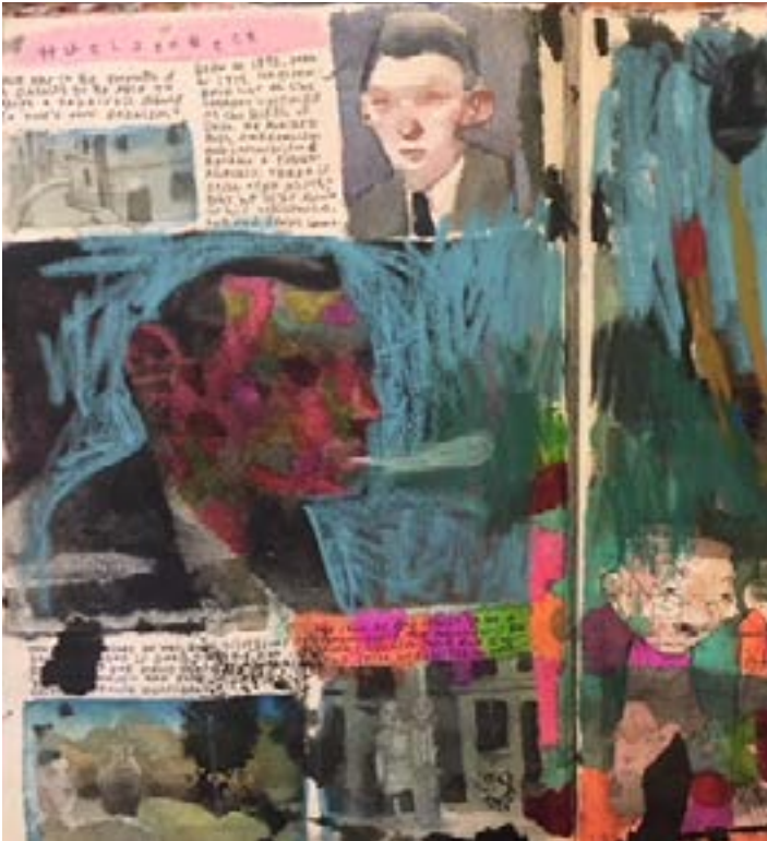
Phil Blank, Untitled , from Sketchbookism series