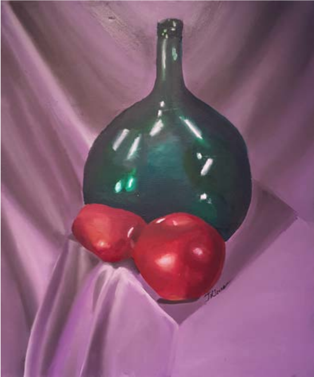
Tajah Green, Still Life , Jurors' Choice 2019