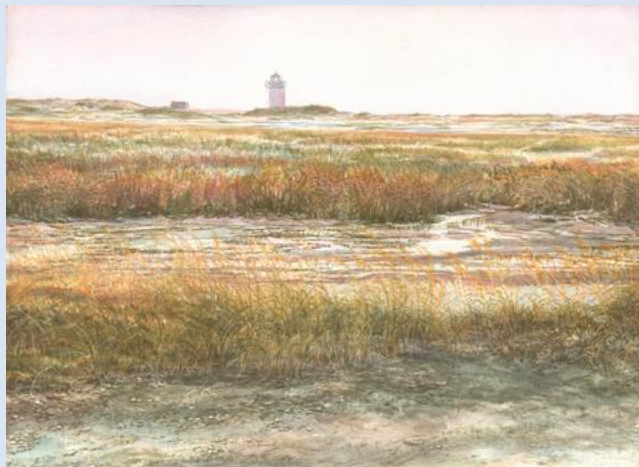
"Woodend Light ~ Provincetown" Watercolour ▲