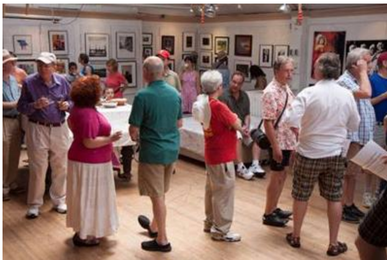
Photo of the reception