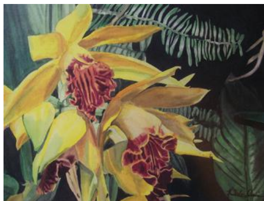
"Longwood Orchid", watercolor ►