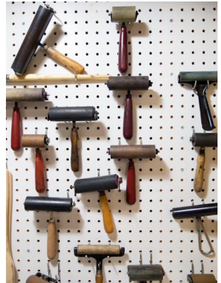
Some Tools of the Trade

The annual Workshop Show is an opportunity open for all workshop attendees to exhibit their work. Come to draw, paint or make prints, and follow in a great tradition.