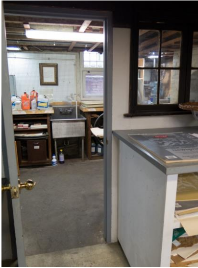
Looking into the Print Studio

Our thanks are extended to the monitors of these sessions who give up their personal time to plan and attend each session. This is a large commitment and we greatly appreciate it.