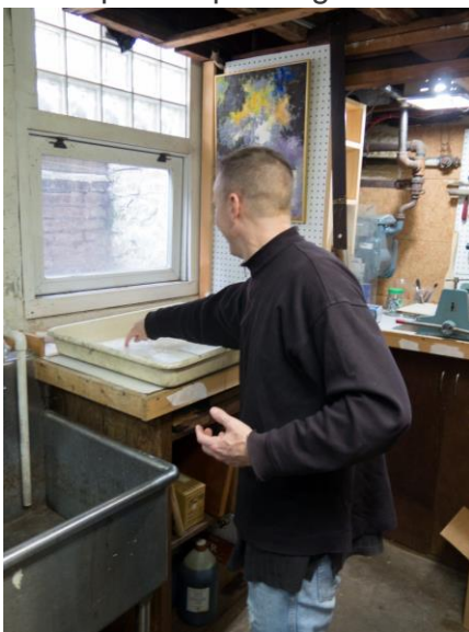
Preparing Paper for a Print

The spacious studio space has been freshly renovated. Newly installed gallery lighting—with ultraviolet filters to protect paintings—is ideal for working artists. The space is also lit by natural light.