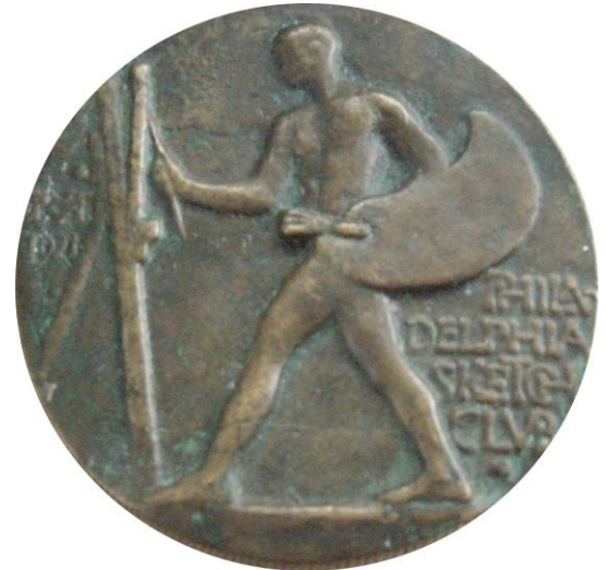
▲ R. Tait McKenzie, Small Oils Medal , bronze