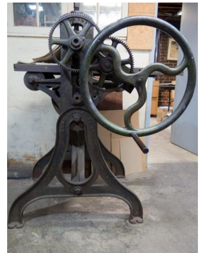
The PSC Etching Press