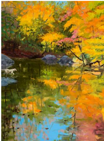
1Dog in the Creek

Opening Reception: Friday, September 9, 5-7PM Gross McCleaf Gallery