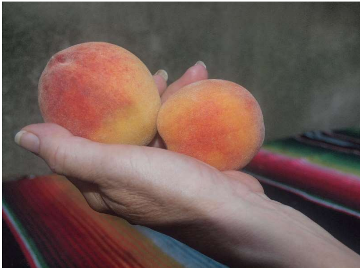
Eat a Peach