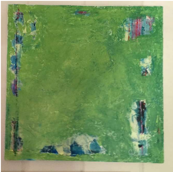
The Colour of Spring

Patricia Ilve's painting "The Colour of Spring" was accepted by PAFA for the following exhibition: