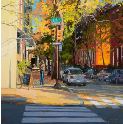
23rd and Pine