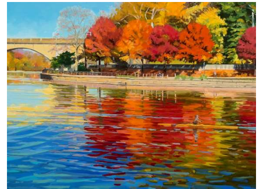
Red Reflections on the Schuylkill

"The exhibit is called "Fall in Philadelphia" and includes many new large oils inspired by the Philadelphia region in the fall. In her characteristic vibrant painterly style, Elaine has captured wonderful street scenes from every part of the city as well as some stream and river reflections from area waterways. The intense yellows and reds and the warm autumn light make the show a feast for the senses."