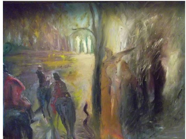
The Myth The Illusion of Separation

The works are inspired by Paul Robeson's life-long battles for racial justice, economic justice and peace.