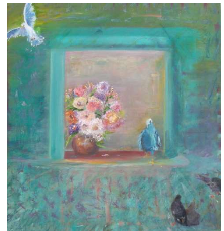
Birds of a Feather

'Birds of a Feather', by artist Susan A. Esbensen is on display at the annual members' show at The Center for Contemporary Art, Bedminster New Jersey. The exhibition runs from June 24-September 3, 2016.