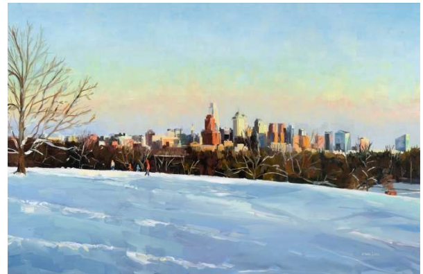
Sledding with a View