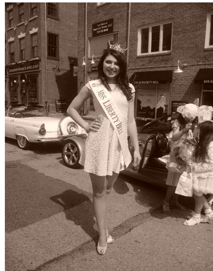
Easter Beauty 2015