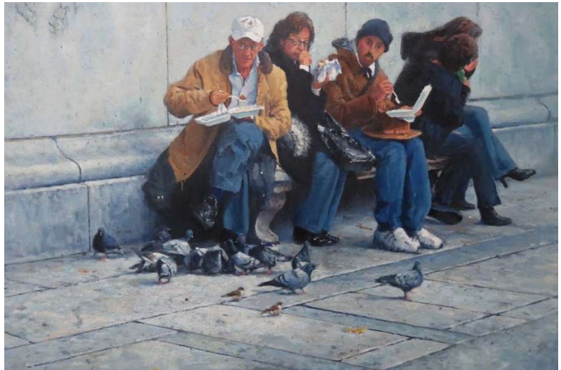
The Lunch Crowd