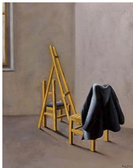
The Room No. 06: 100cm x 80cm Oil on Canvas 2015