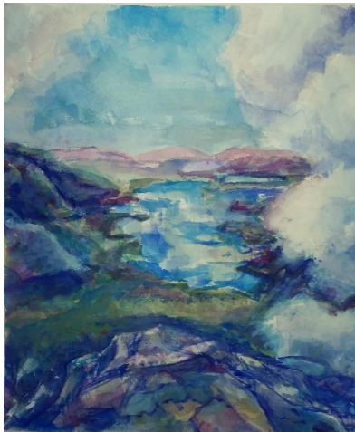
In the Clouds View from Whiteface