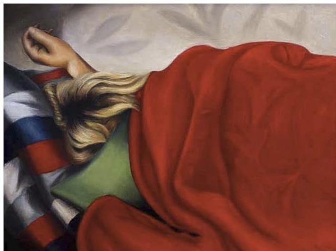
Hypnos No. 02: 90 cm x 120 cm Oil on Canvas 2016

Moreover, during this year he will find himself a participant of the annual exhibition "November 19" with the diptych "Announcement" part of the painting series "Myths and Symbols No. 2" or in "Edward Lear", where he will participate with two works part of the "Hypnos" painting series. Currently he is working as an artist in Philadelphia PA, United States where he is also residing.