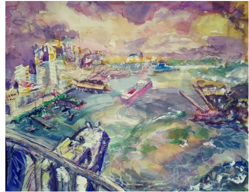
Port of Philadelphia