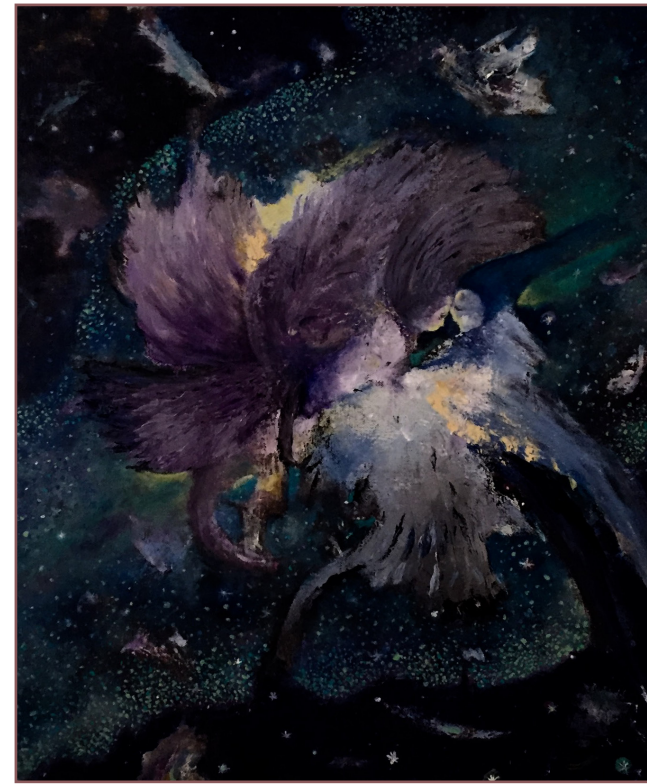
Saikim Kumnuantipaya, Eternal Love