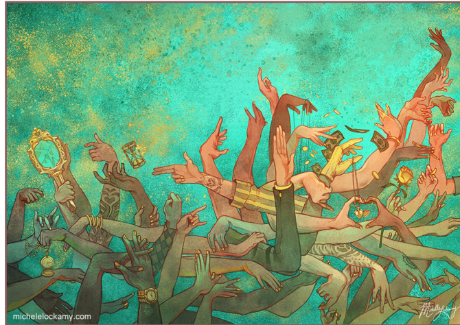
Michelle Lockamy, Obsession , First Place 2018