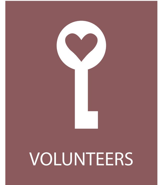
A celebration of Sketch Club volunteers.