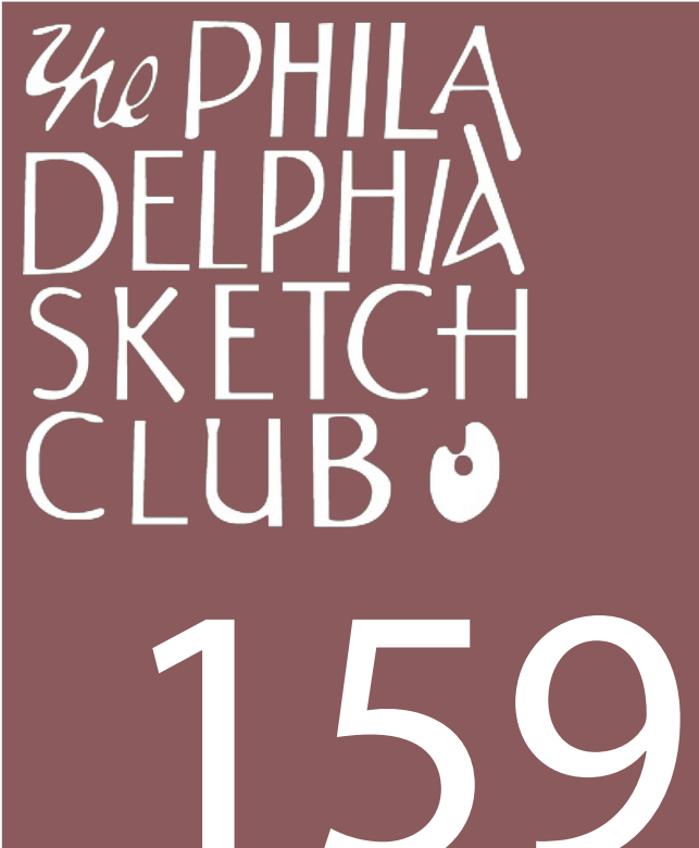
Celebrating 159 years of the Sketch Club.