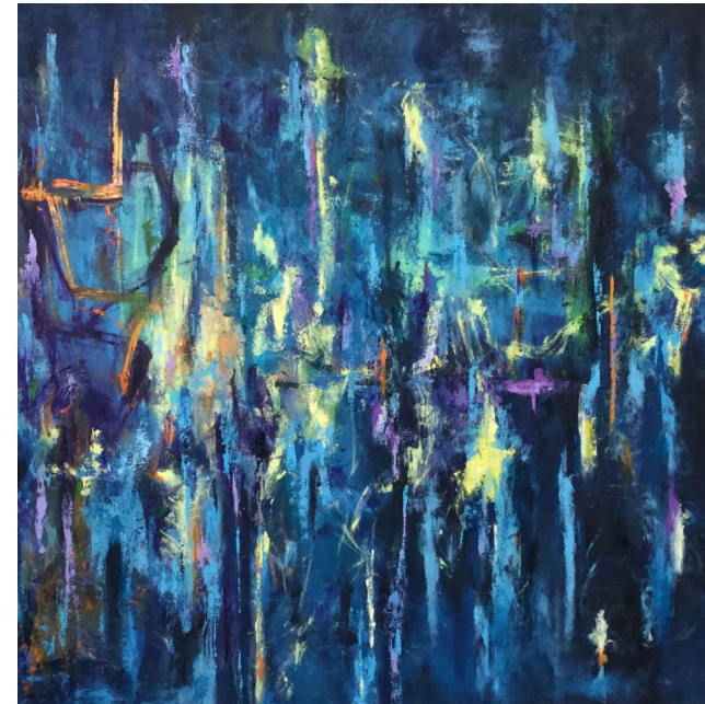
Cathie Meighan, Uncharted Waters , First Place 2018