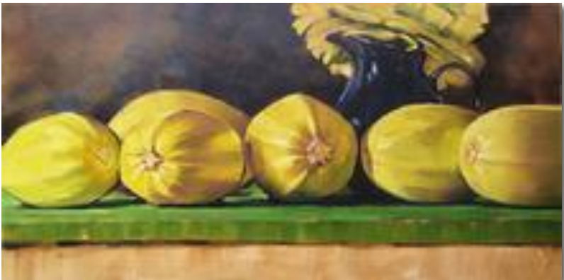
Yellow Squash - Larry Chestnut