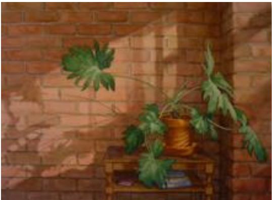
Casting Shadows - Lauren Sweeney