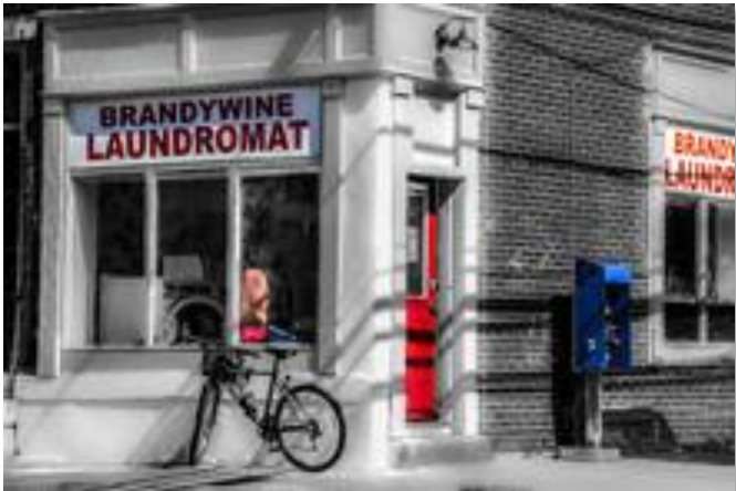
Laundry Day - Dan Cook