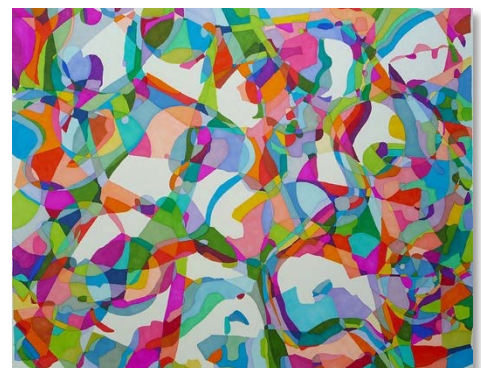
Day Dreaming Acrylic on canvas 14" X 17.5"