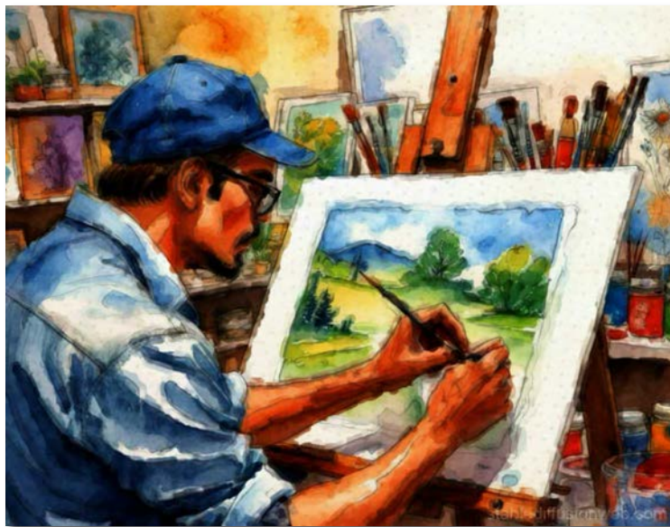
Watercolor Painting Illustration Digital mixed media with AI elements Don Gauger

Watch for details coming soon. Happy painting!