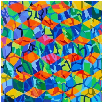
Feels so Good Acrylic on canvas 32" X 32"