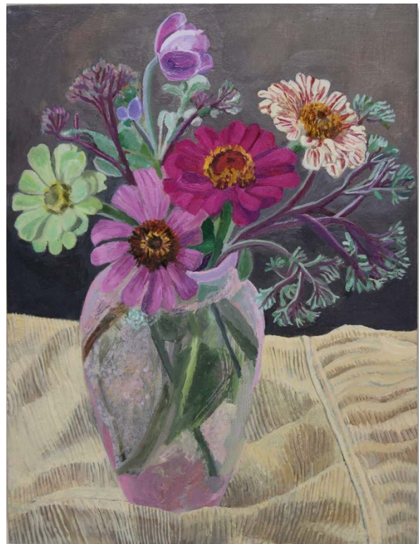
August Flowers (Private Collection) Oil on Panel, 9 3/4" X 7 1/2"