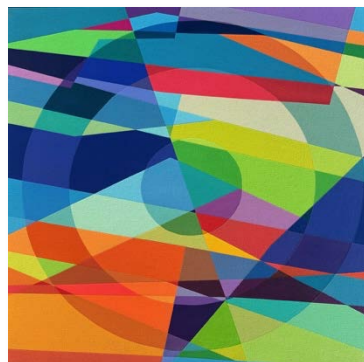
Above the Light Acrylic on canvas 24 X 24"